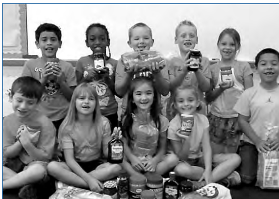
Epiphany Catholic School – Grade 2 Students

Foundational to the experience at Catholic schools is our belief and practice of coupling a strong and rigorous approach to faith formation – education in the Catholic faith and spiritual growth on the core convictions of Catholicism – with a high-quality academic program of study for students. Belief in the church's social teaching is integral to our identity and mission as Catholics. There is a spiritual disposition evident in the life and work of our schools. It is evident in the lived experiences of students throughout the school year – in the prayers that begin and end daily