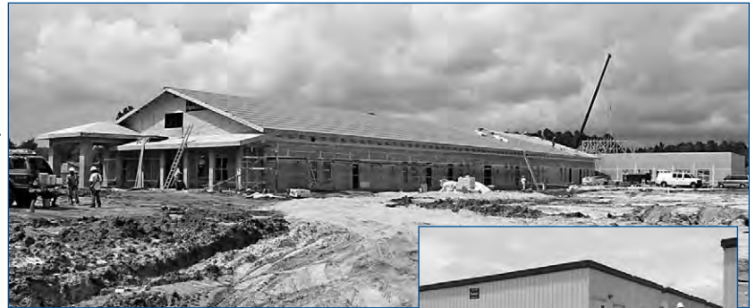
The construction for the new school building should be complete in early 2014.