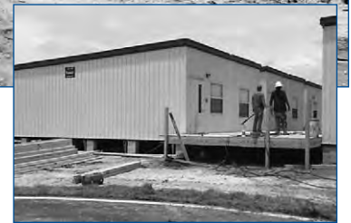
Temporary "cottages" on the new property serve as classrooms until construction of the new school building is complete.

One of St. Patrick's proudest moments occurred on May 1, 1997. It was on this day that Bishop John J. Snyder dedicated the Shamrock Center. This building housed a large gymnasium, classrooms, coach's office, kitchen, meeting rooms, and storage spaces. This building enabled the school and parish of St. Patrick's to interact as a community.